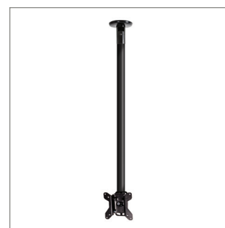
Compatible with B-Tech's professional range of poles and collars