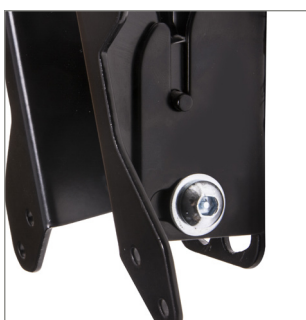
Security locking screws help prevent unauthorised removal of the screen