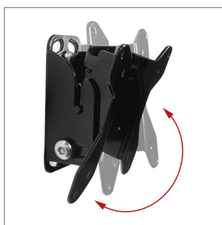
Easy tilt adjustment of \pm 18^{\circ}