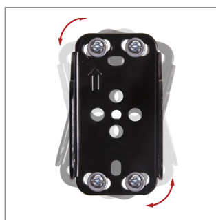
'OWLS' On Wall Levelling System